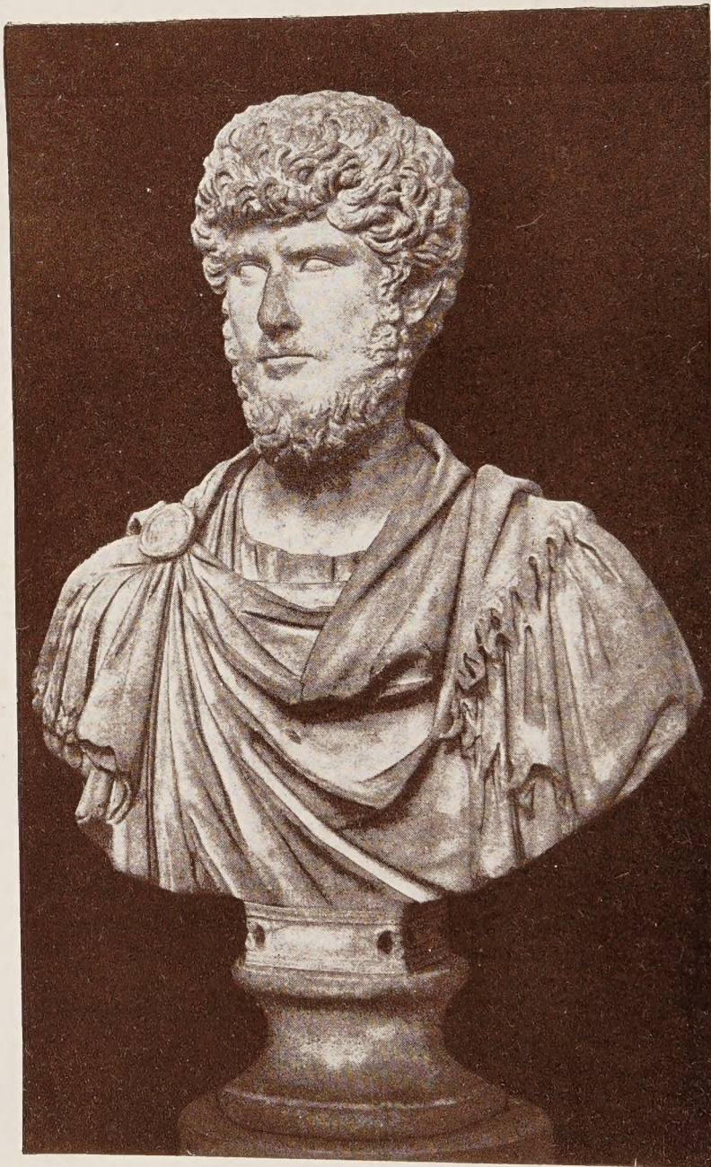
The Emperor Marcus Aurelius